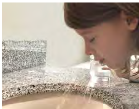
9. Rinse with water and SPIT OUT

For more asthma videos, handouts, tutorials and resources, visit Lung.org/asthma .