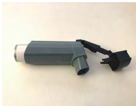
1. Take the cap off the inhaler