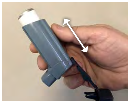
2. Shake the inhaler for 5 seconds