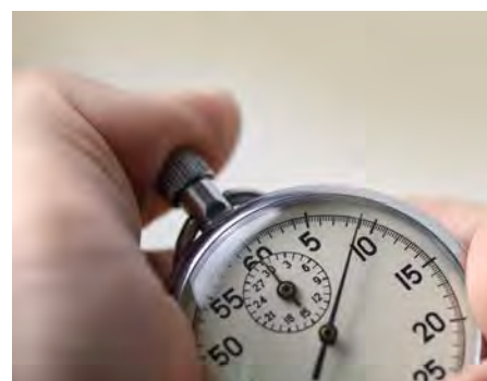
If you need another puff of medicine, wait 1 minute then repeat steps 5-9.