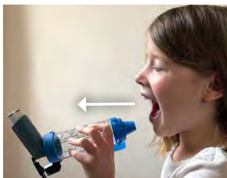
4. Breathe OUT all the way